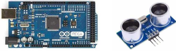
Fig. 1. Illustrations of the micro-controller and sensor considered in this work.

first stage selected by the user and the tank must be empty. Thus, the Arduino calculates the height of the sensor relative to the base. After that, 1L of liquid is added to the tank and the sensor computes a new height. Based on these data, the micro-controller is able to calculate the area of the base of the tank, and the user can perform measurements. Figure 2 illustrates the designed system and prototype.